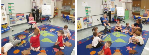
A few peers sharing a red item.